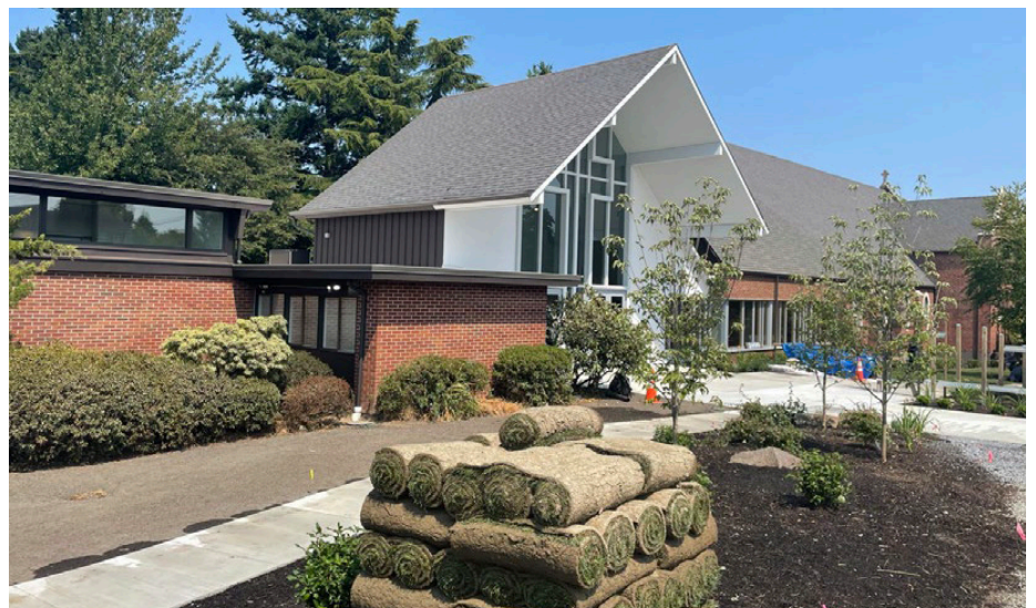
Guy Michaelsen working with landscape crew on planting day.