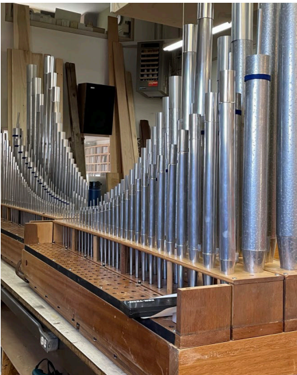
Fred from LZL and Rene from Marceau Pipe Organs working on the details of the new installation.

BUILDING RENOVATION DETAILS ARE AVAILABLE ON OUR WEBSITE: https://ourredeemers.net/about/ build-the-vision/