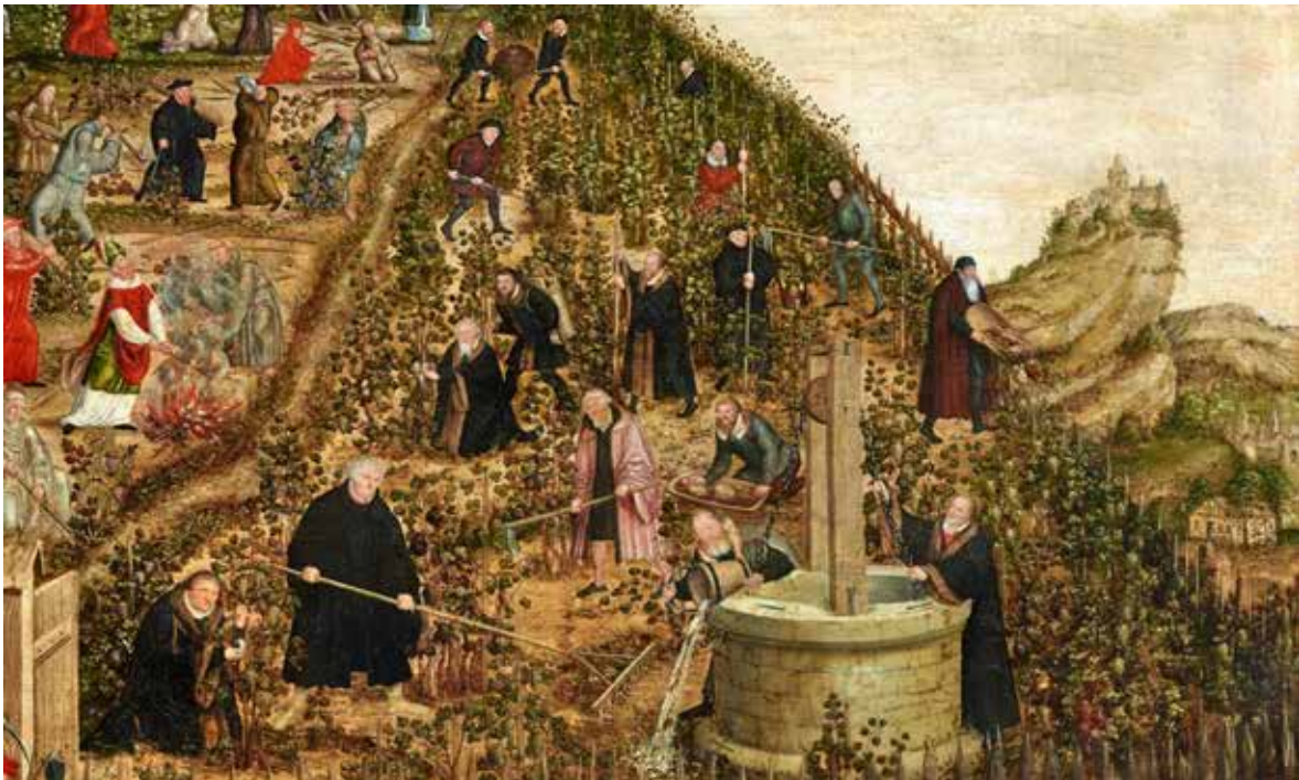
The Vineyard of the Lord