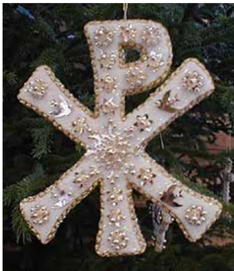
One of the 60+ year old Christmas ornaments used each Christmas at Our Redeemer's.