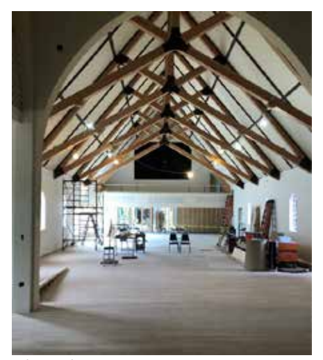
Chancel & Sanctuary