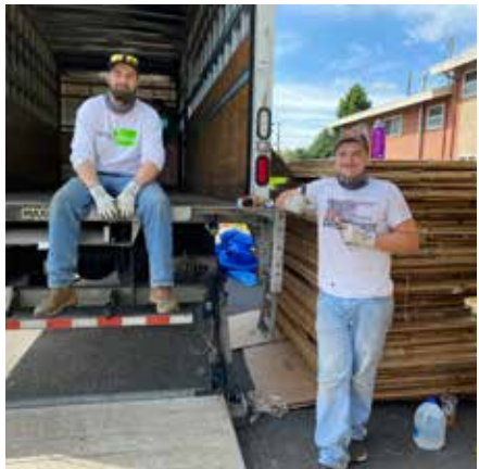
Above and on the cover: at the recycling event in our church parking lot.