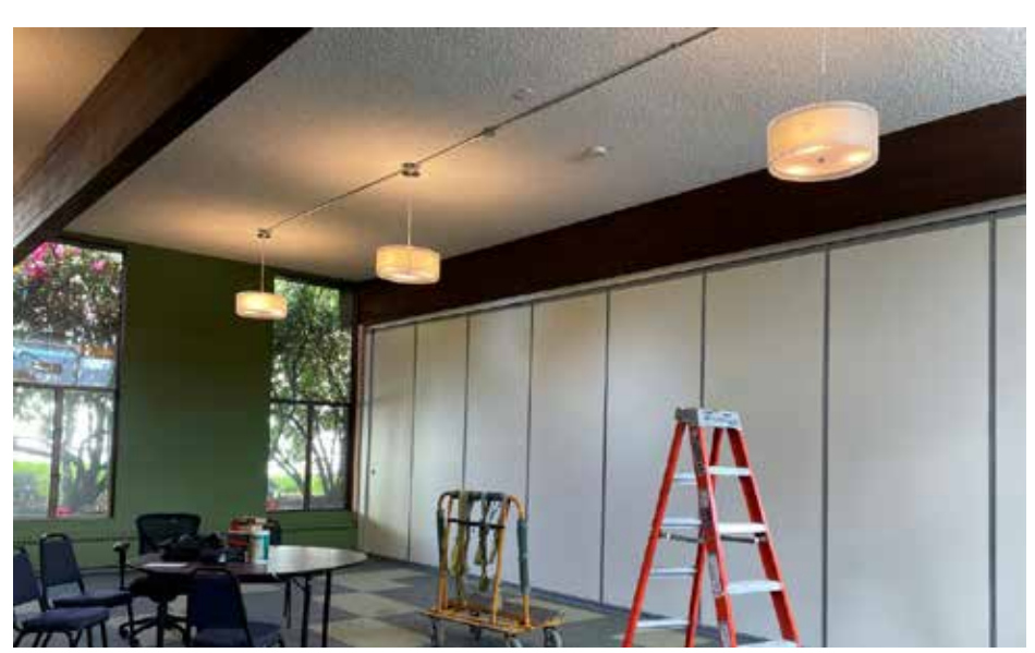
Fellowship Hall Operable Partition

The reclaimed pews have been sanded and installation started June 2nd on the first wall of paneling and the bench under the long window wall. The week of 6/14, the contractor began the exterior site work including concrete and stair removal, grading, and the forming/pouring of the new entry and plaza and walkways. Paint in the Sanctuary began the week of 6/14 with acoustical panels to follow.