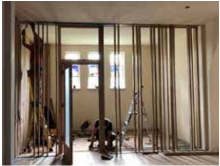
Chapel West Wall (opaque glass is still to be installed)