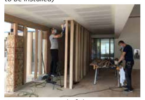
Grove at West End of the Sanctuary