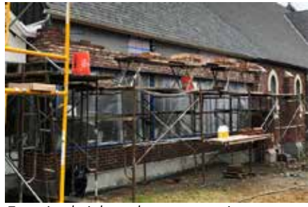
Exterior brick and parge coating.