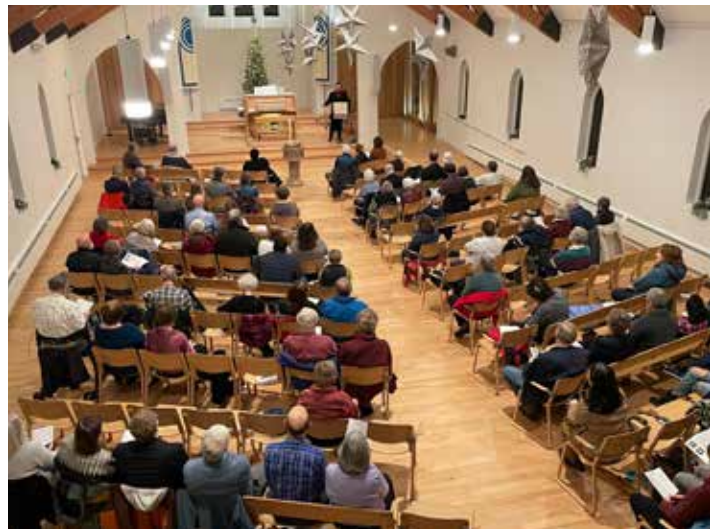
Our January 6 Organ Dedication concert was a wonderful event!