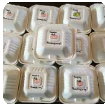
Photos this page: Helpful hands got together at Our Redeemer's on November 21st to make individually packaged mini pies to feed those who are hungry at Thanksgiving.