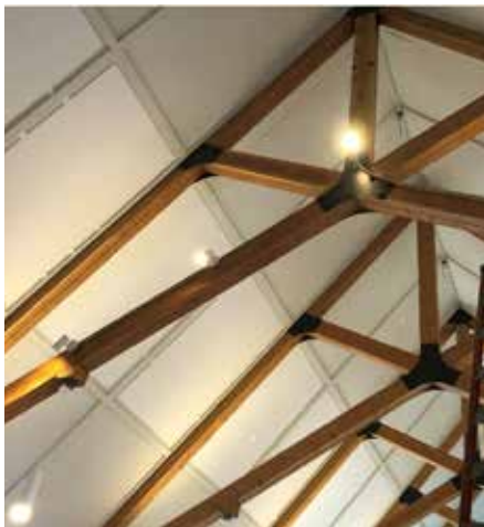
Acoustical tile install in Sanctuary.

The exterior brick and parge coating wrapped up mid-June. Site work started with the removal of the stairs to the west of the Fellowship Hall and the existing entry concrete. That area began to take shape and the new entry concrete and paths were formed and poured.