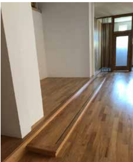
Upper Chancel steps looking towards the Chapel.

JULY 20, 2021: The work continues to progress well towards completion. On the exterior, sidewalks and the entry concrete are underway. Planting beds have been defined and irrigation work is nearly complete. Exterior painting of the entry, overhang, and Fellowship south façade are also underway. Inside the building, the acoustic panels in the Sanctuary are complete as is the lay-in ceiling in the Administration. New roller shades have been installed on the south windows of the Sanctuary, the carpet install is underway, the wood floor is sanded and has 2 or 3 seal coats applied, lighting work is ongoing and the audio visual systems have begun. We are closing in on the finish! August will see final inspections, installation of phones and internet, and staff move into the new space. Marceau Pipe Organs of Ballard is scheduled to begin the installation of the organ and chimes. We will also see sod laid and plant installation in the beds along south side of the Church.