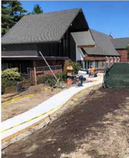
New sidewalks leading from the entry to the Fellowship Hall.

JULY 2, 2021: This is the fun part of the project; finishes are being installed and the character and beauty of the space is becoming very visible.