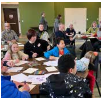
Below: At "Art Church" Adult Forum in March.