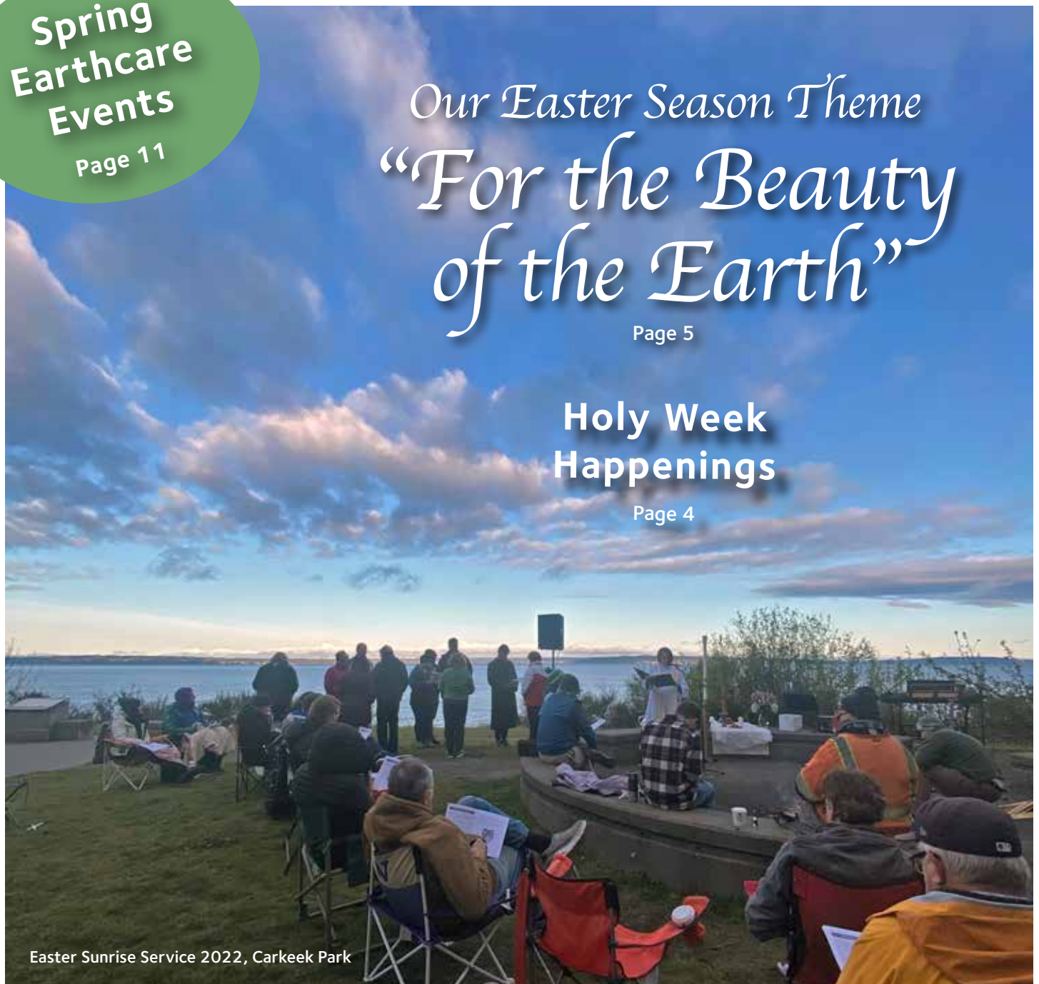
Easter Sunrise Service 2022, Carkeek Park