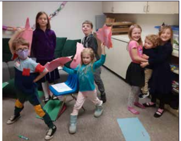
Our surprising kids!

Finally, teaching Bible stories is a good way to encounter them afresh. From Jonah and the Whale to the Prodigal Son, we've got some great material to work with. Over and over, it seems to me, these stories seem to be about drawing us out of selfish, anxious wandering and into trusting, purposeful relationships. Of course, the kids don't always sit still and listen. But maybe they're just acting out the sort of distractions we all experience when God is trying to reach us. We go off on silly tangents all the time, but when something "clicks," it's so worth it.