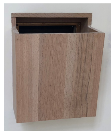
New Mail Box (pew material)