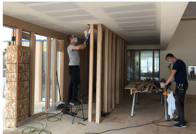
Grove at West End of the Sanctuary

Inside the Church, final carpentry details are wrapping up this week. The reclaimed pew material has been used throughout the building and is beautiful. Fixtures (sinks, toilets, water fountains, accessories) have been installed on both levels of the building and the painters are ready to begin their work in the Narthex and Sanctuary. Their work will include wall and ceiling paint along with the clear sealer that is being applied to the trusses, groves, window and system.