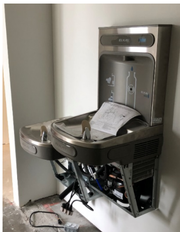
Lower-Level Drinking Fountain

Inside the Church, final carpentry details are wrapping up this week. The reclaimed pew material has been used throughout the building and is beautiful. Fixtures (sinks, toilets, water fountains, accessories) have been installed on both levels of the building and the painters are ready to begin their work in the Narthex and Sanctuary. Their work will include wall and ceiling paint along with the clear sealer that is being applied to the trusses, groves, window and system.