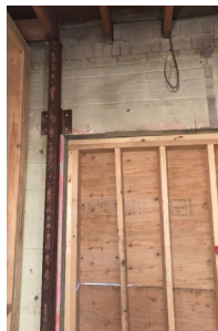
Columns at Lower Level & Sanctuary