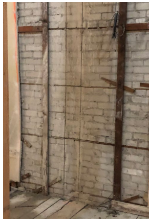
Sawcut for Column