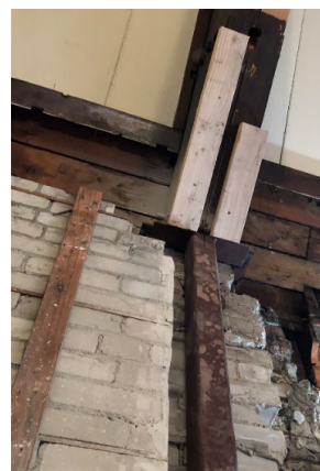
Truss to Column Connection