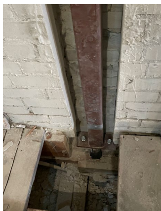
Connection at Foundation Wall