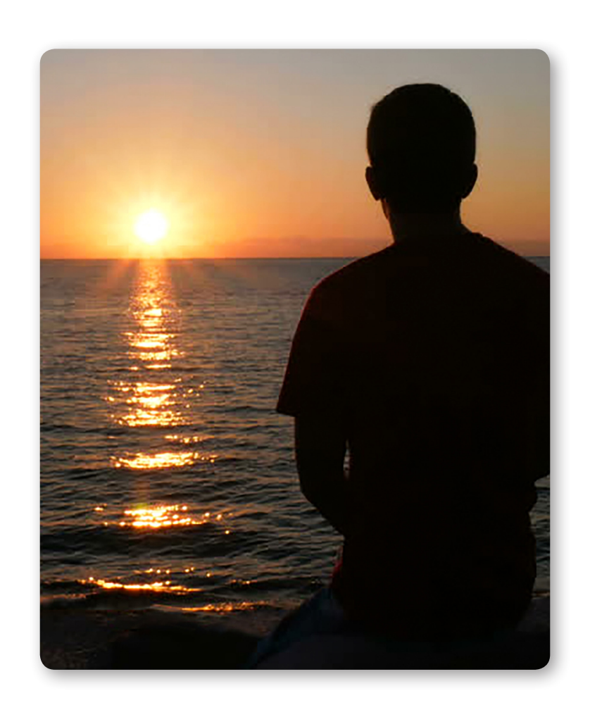
Fifth Sunday after Epiphany February 10, 2019 9am